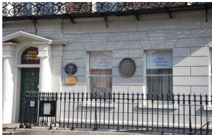
Many classes take place in the Oscar Wilde House, childhood home of Oscar Wilde

Students must have the equivalent of five High School passes including English. Mature students (over 23 years of age in the year of application) are admitted on the satisfactory completion of an interview. Please see page 8 of the prospectus about making a direct application