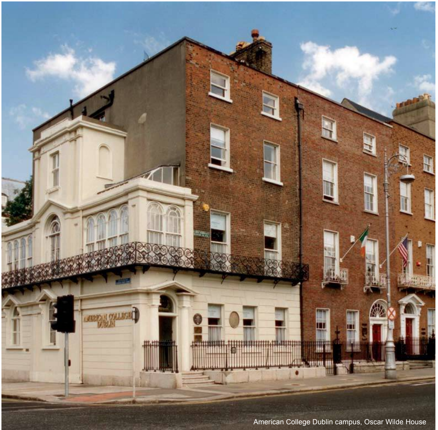
American College Dublin campus, Oscar Wilde House