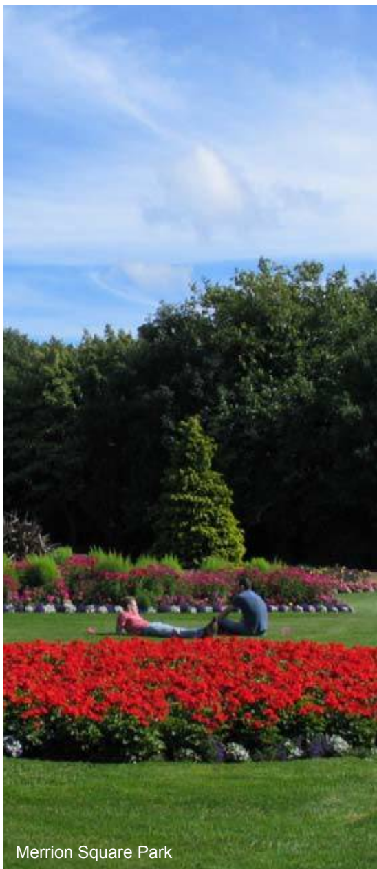
Merrion Square Park